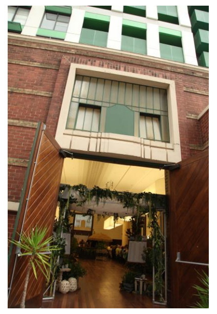
Exterior Drill Hall

Since 2013, it has formed part of the Multicultural Hub (managed by AMES Australia) and is used as a hire venue for events and meetings. The hall is suited to a range of activities including forums, expos, launches, celebrations, workshops and fitness sessions.