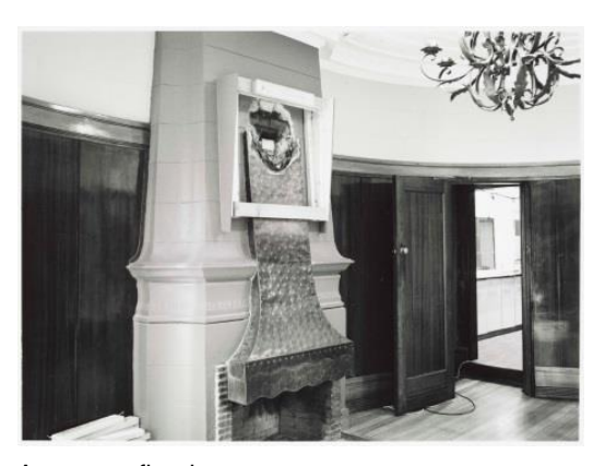
Anteroom fireplace